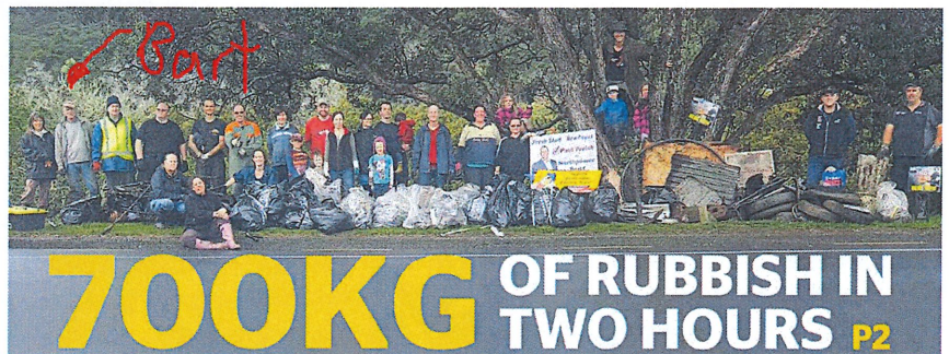
30 Volunteers from Love Whangarei Clean Up collected 700kg of rubbish in 2 hours from the Hatea riverside 22 July

All over New Zealand thousands of Kiwis are set to do the right thing and take part in New Zealand's largest clean up event in September. Keep New Zealand Beautiful have now partnered with G.J. Gardner Homes, to bring a bigger and better annual Clean Up Week. 10-16 Sept 2018